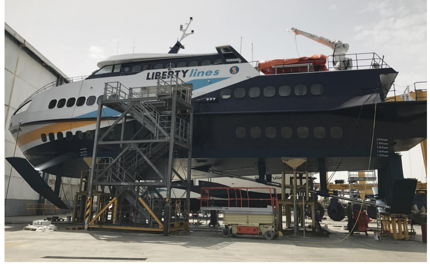
The third 32m Admiral 250 hydrofoil completed, Carmen M, at the Trapani shipyard earlier this month